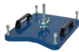
[ 8 ] Vacuum plate