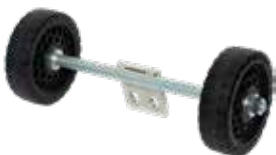
[ 5 ] Wheel set CDR 250