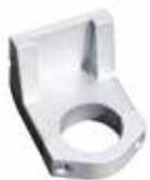
[ 1 ] Collar