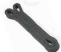
[ 4 ] Vacuum sealing ring