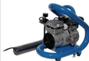
[ 7 ] Vacuum pump