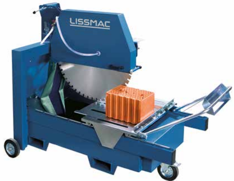
DTS 1000 H