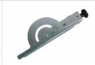
[ 3 ] Side stop