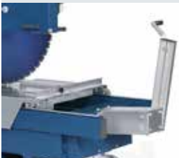
[ 1 ] DTS 1000 V