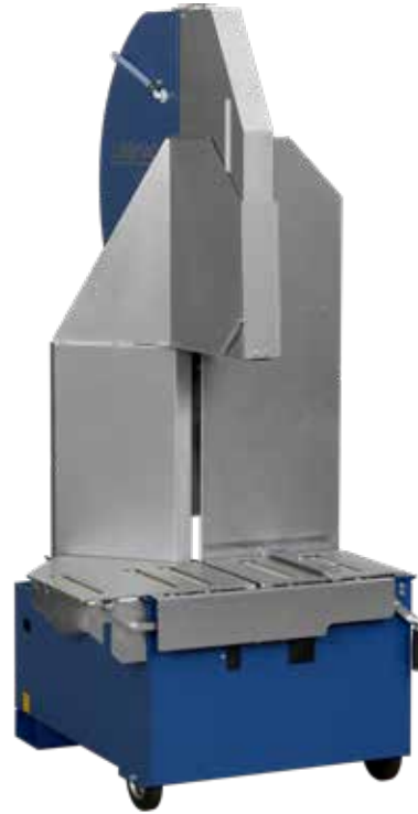
DTS 420 PE/N